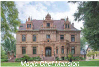
Magic Chef Mansion

On September 26th, join our St. Paul's family on a tour of the Scott Joplin House, the Campbell House Museum, and the Magic Chef Mansion. Enjoy lunch in the historic Carondelet and Dutchtown Neighborhoods, where we will hear of the Evangelical Free Church mission in these South St. Louis Communities.