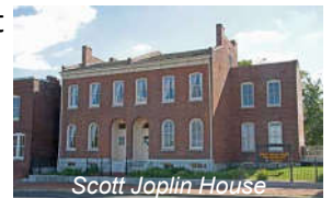
Scott Joplin House