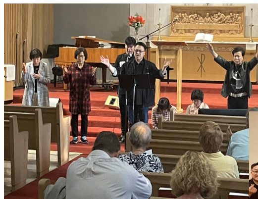
Korean Intercessors Prayer