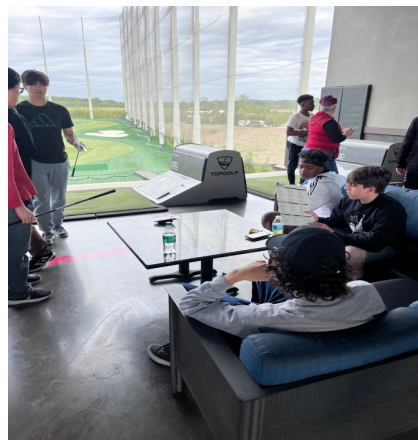
Youth Night at TopGolf