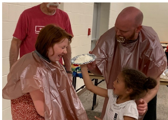
Cultivate Kids Wrap-up