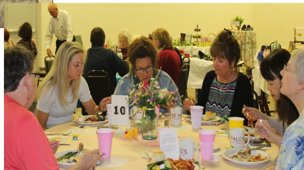
May 5 - Mother Daughter Banquet

Send your pictures to stpauls@stpaulsefree.org to be included In the next month's newsletter!