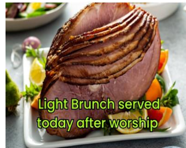
Light Brunch served today after worship

5e Symphonie (Op. 42, No. 1): Toccata Widor